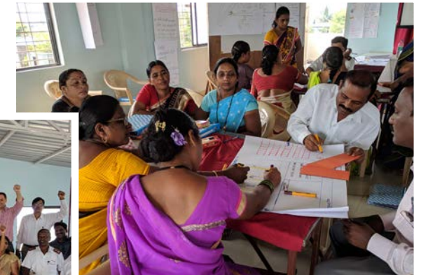
Beta testing Module 1 with Salvation Army in India in 2017