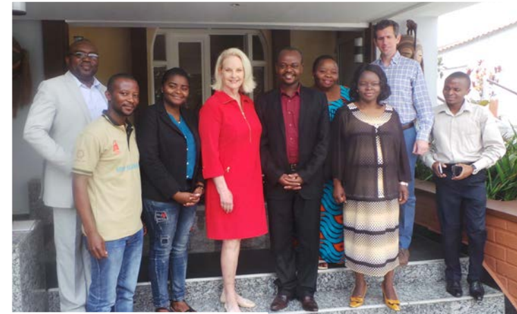
Cindy McCain in the Congo

model demands rigorous M&E – you can't cure what you can't count. We identify slavery hot spots and causes then follow up to record results and improve our methods. We pioneer the science of liberation.